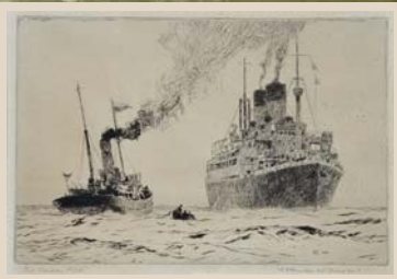
The London Pilot, etching, signed in pencil by Norman Wilkinson, British Marine Artist

Back at the easel, he has chosen to work with his favorite subject, an unusual ocean scene by Norman Wilkinson as inspiration. Once again, he's out in the waves capturing a dramatic mo-