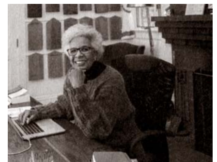
Nell has also written the NYT Best Seller The History of White People . That's my next book.

In Nell's memoir, she sees artists differently, since her creative juices began flowing later in life. She has the advantage of maturity in her outlook. So I look back on my years at MassArt, and consider what it might have been like if I were the age I am now. Without the distractions of youthful insanity and inexperience, would I truly be An Artist?